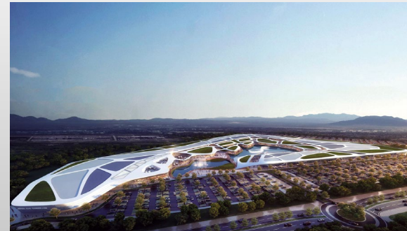
Open Sky Shopping Mall – Madrid - Spain