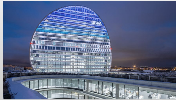
BBVA Central Office – Herzog & De Meuron, Madrid - Spain