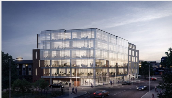
Sharp Building, Dublin – Ireland

Our products have been used in a variety of applications, from state-of-the-art office buildings to world-renowned stadiums. Let our ever-growing portfolio help inspire your next project. Here's a few more examples. Contact us for more information on JUNO's reference projects.