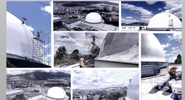
Military Geographical Institute of Ecuador, Quito - Ecuador

*Contact us for more reference projects.