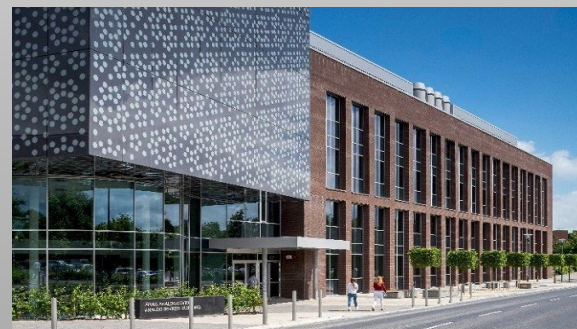
University of Limerick – Bernal Institute, Limerick - Ireland