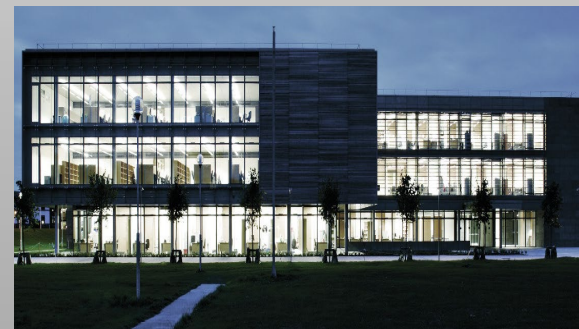
Maynooth University Academic Facilities, Kildare - Ireland