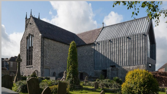
St. Mary's Medieval Mile Museum, Kilkenny - Ireland