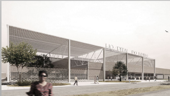
Kuito Provincial Hospital, Kuito - Angola