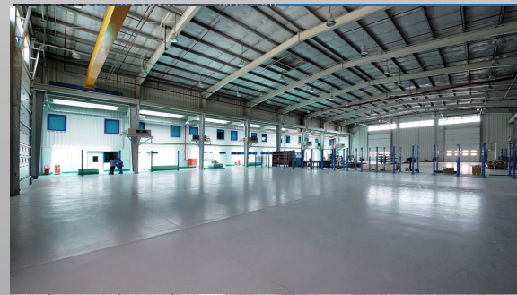
Schlumberger Oman Oilfield Services Facility, Nizwa Oman