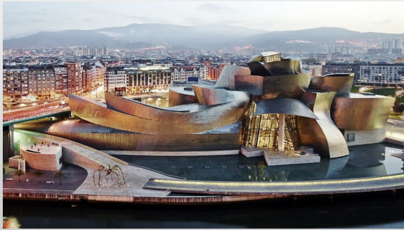
Guggenheim Museum, Bilbao - Spain

Our products have been used in a variety of applications, from state-of-the-art office buildings to world-renowned stadiums. Let our ever-growing portfolio help inspire your next project. Here's a few more examples. Contact us for more information on JUNO's reference projects.