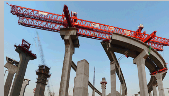
Jamal Abdul Nasser Street HW Project - Kuwait City, Kuwait