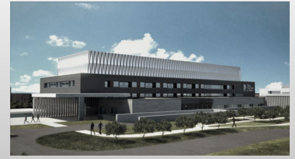
Navarra University Hospital, Madrid - Spain