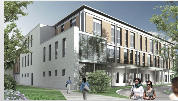
St. Luke's General Hospital, Kilkenny - Ireland