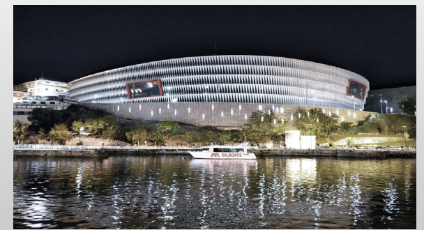
San Mames Football Stadium Bilbao - Spain