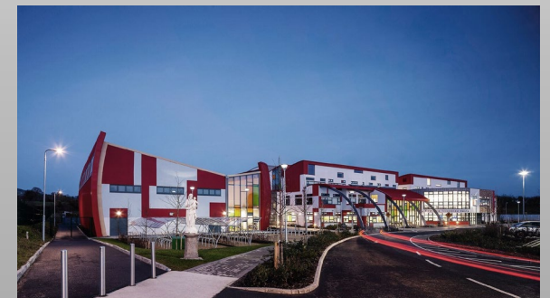
Scoil na Tríonóide Naofa, Doon, Co. Limerick - Ireland